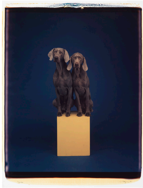
Two on, 1991

Huxley-Parlour Gallery is pleased to announce a solo exhibition of 20 x 24 Polaroids by the celebrated American artist William Wegman.