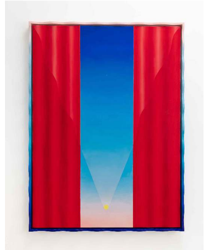
Freefall, oil on linen in painted wood frame, 2024

Emily Weiner's practice examines art historical imagery and repeated motifs which she reimagines through new perspectives, in particular investigated these symbols through a feminist and Jungian lens. Weiner seeks to investigate how reconfiguring these symbols can generate new understandings across generations and how imagery and its attached meaning can evolve.