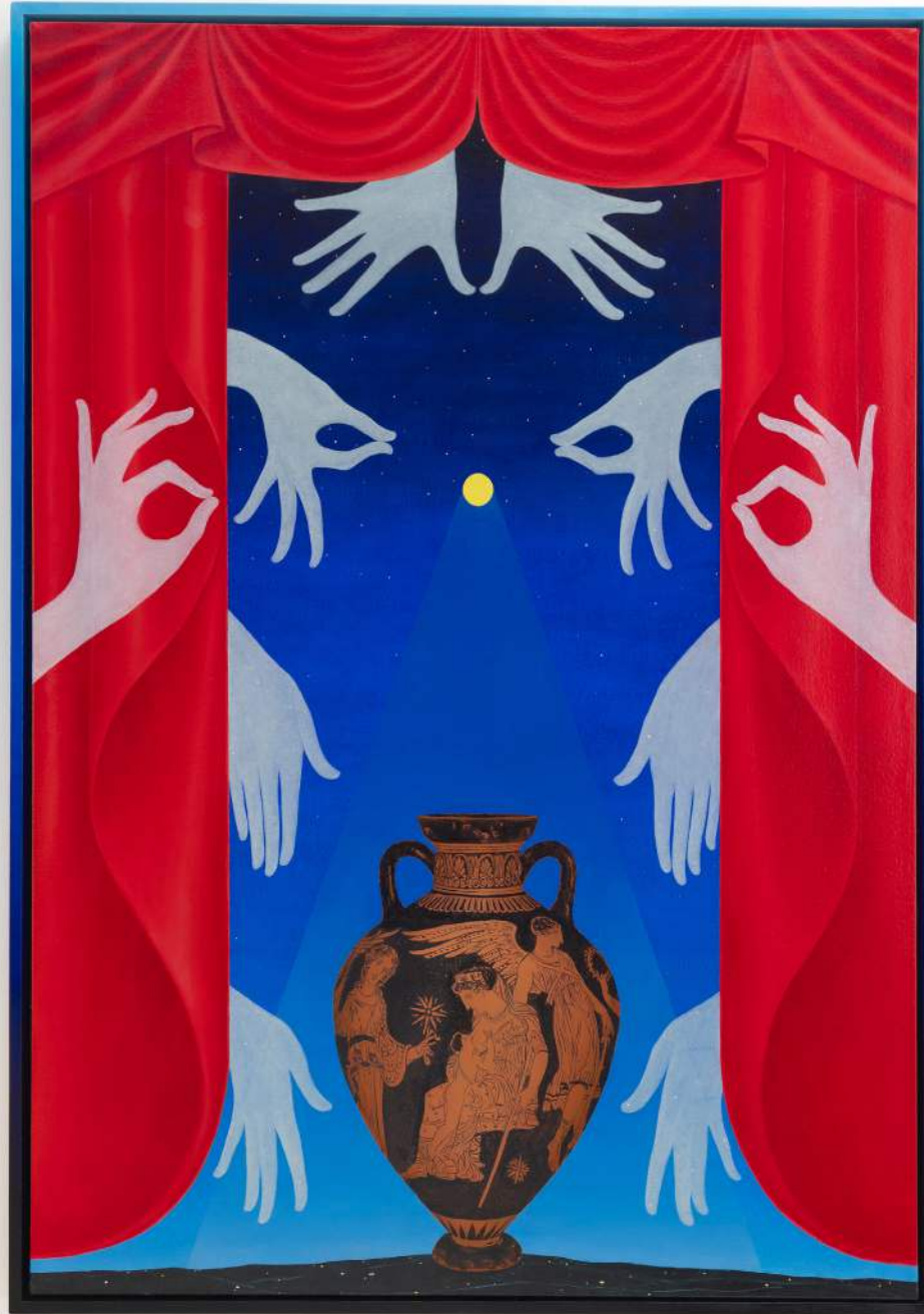
Origins, 2024 Oil on linen in painted wood frame