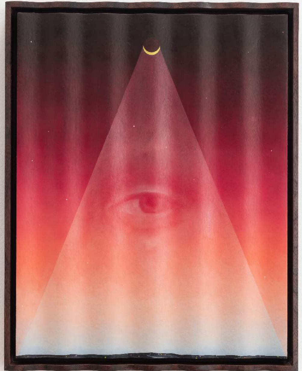
Providence (Apparition), oil on shaped MDF in wood frame, 2024